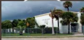
CUTLER RIDGE ELEMENTARY SCHOOL 20210 CORAL SEA ROAD