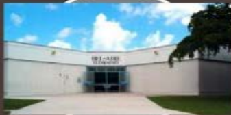
BEL AIRE ELEMENTARY SCHOOL 10205 SW 194 STREET