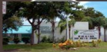
WHISPERING PINES ELEMENTARY SCHOOL 18929 SW 89 ROAD