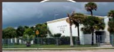
CUTLER BAY MIDDLE SCHOOL 19400 GULFSTREAM ROAD