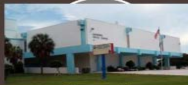
CUTLER BAY SENIOR HIGH SCHOOL 8601 SW 212 STREET