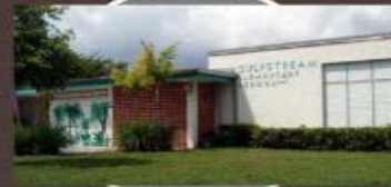
GULFSTREAM ELEMENTARY SCHOOL 20900 SW 97 AVENUE