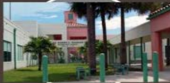
DR. EDWARD L. WHIGHAM ELEMENTARY SCHOOL 21545 SW 87 AVENUE