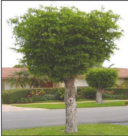
Removal of more than 25% of a tree's canopy